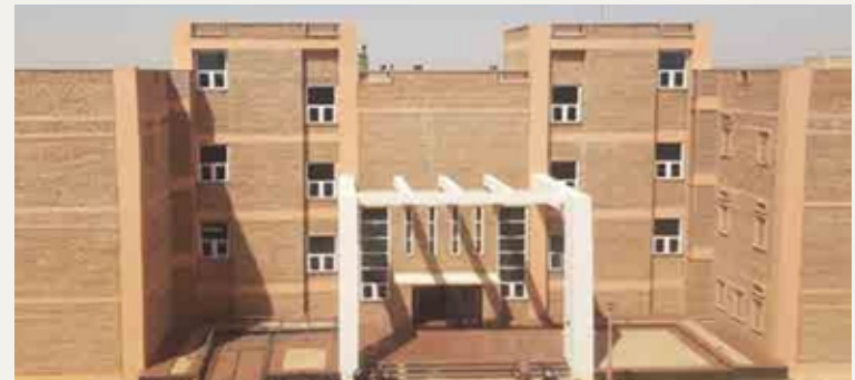
BIOSCIENCE & BIOENGINEERING BUILDING