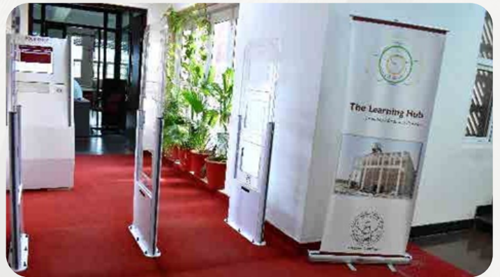
RFID GATE & DROP - BOX