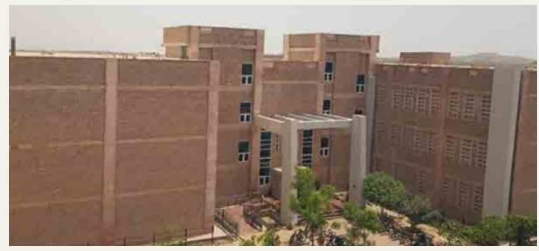
METALLURGICAL & MATERIALS ENGINEERING & CHEMICAL ENGINEERING BUILDING