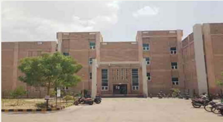
BASIC LAB BUILDING