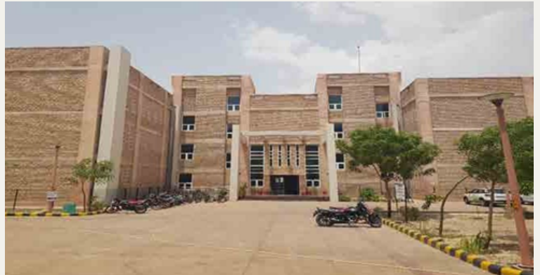
COMPUTER SCIENCE & ENGINEERING BUILDING