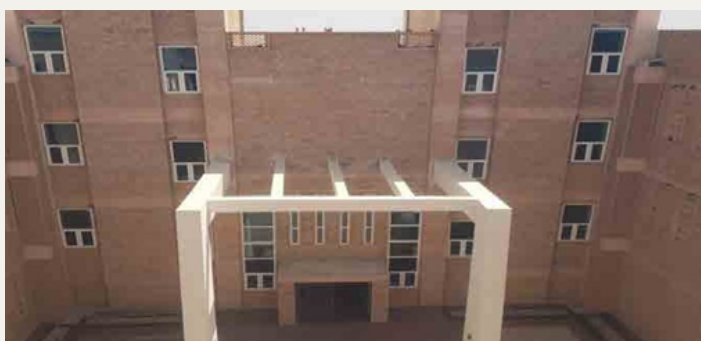
SCHOOL OF ARTIFICIAL INTELLIGENCE & DATA SCIENCE BUILDING