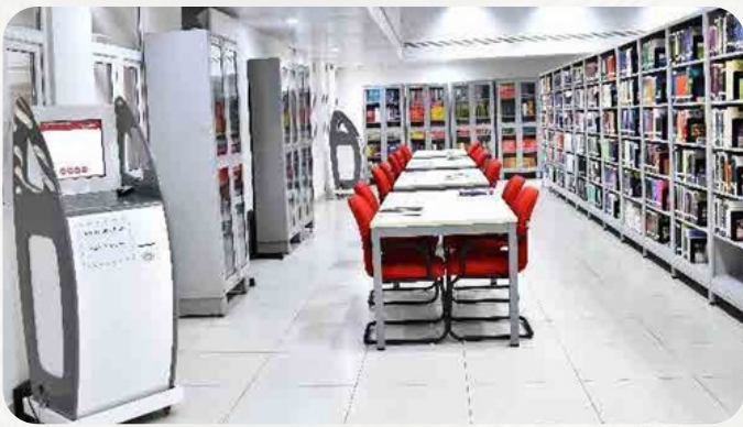
STACKS & GENERAL SECTION

The Learning Hub, i.e., the library supports teaching and research activities of the Institute by facilitating acquisition, organization, and dissemination of knowledge resources, and also by providing library & information services to IIT Jodhpur community. The library has a rich and growing collection of approximately 15,600 volumes of books and e-books, which include textbooks, and books of general and reference nature. A wide range of scholarly journals, databases and research support tools are also subscribed from various sources for the academic and research purposes of the Institute.