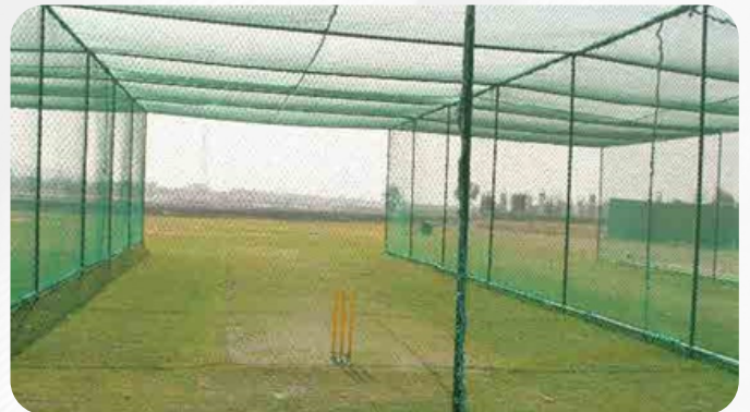
CRICKET GROUND PRACTICE PITCHES